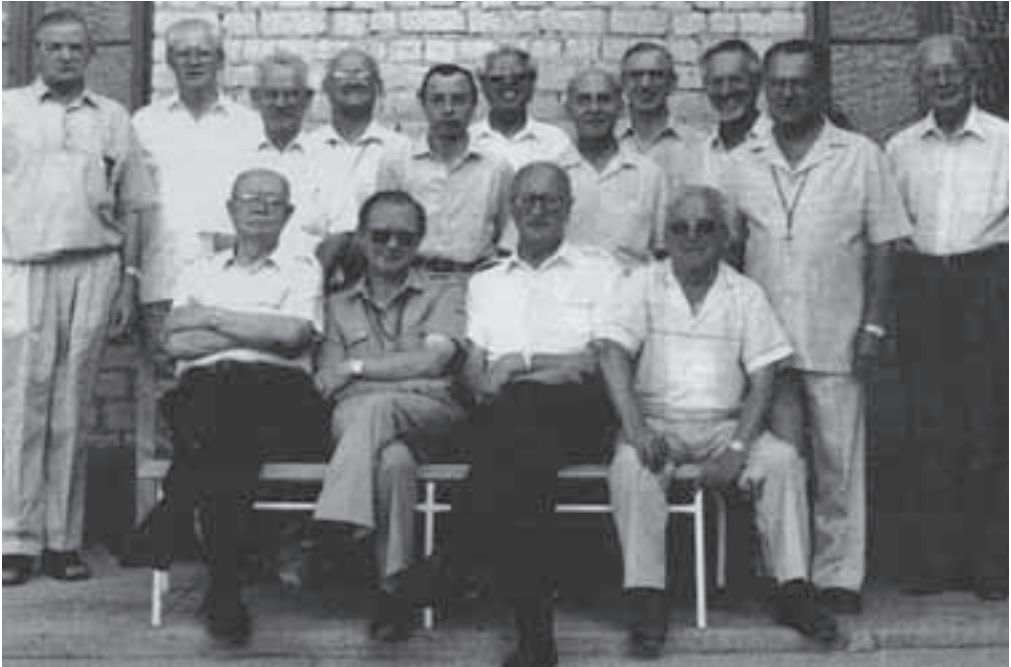
Brothers CMM in Namibia 1992