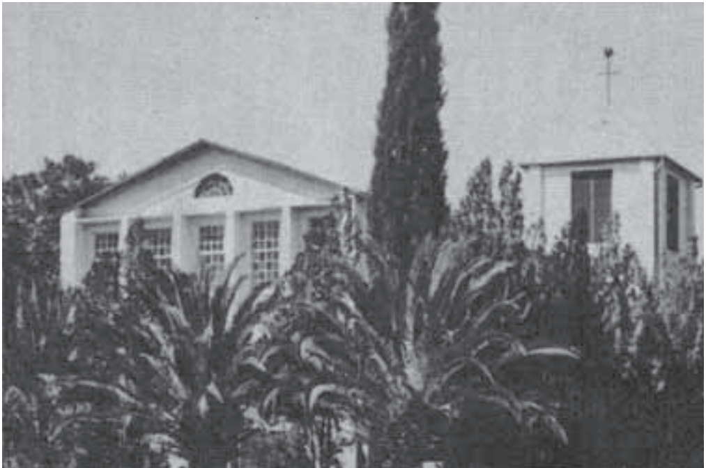
Catholic Church in Tsumeb