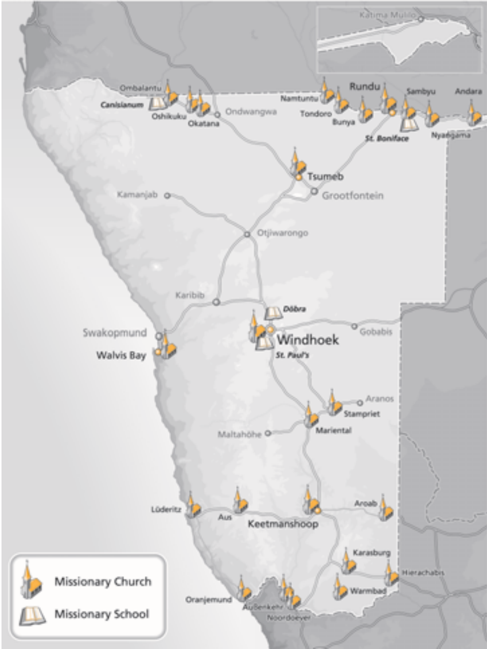
Some of the places where Dutch missionaries worked between 1948 and 2006. Map by Bart Hendrix.