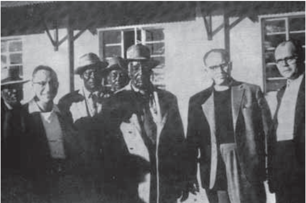
Herero Chief Visit to Döbra