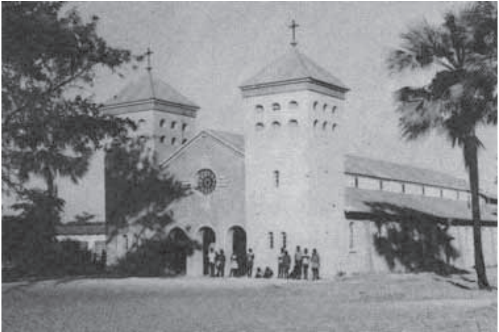
Catholic Church in Oshikuku